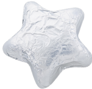
#CHOCSTAR Stock Design: Patriotic_11