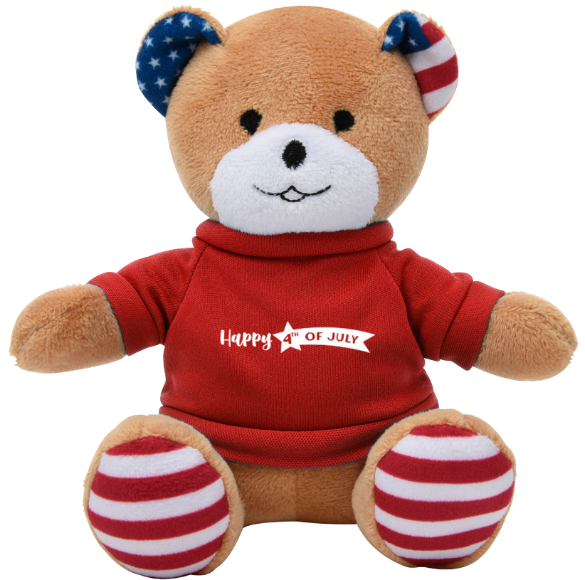
#1278 Stock Design:Patriotic_11