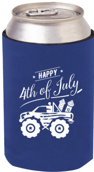
#34 Stock Design:Patriotic_15